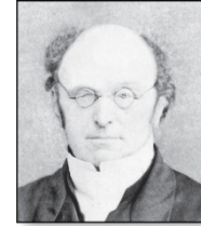
Augustus De Morgan